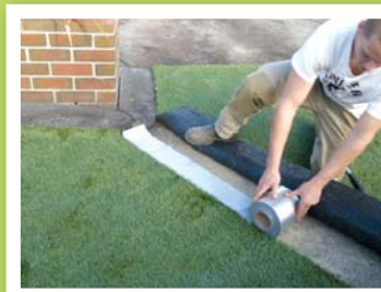
Place Ezistrip between the grass pieces