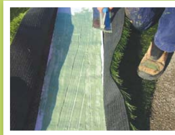
Aligning and joining grass onto tape