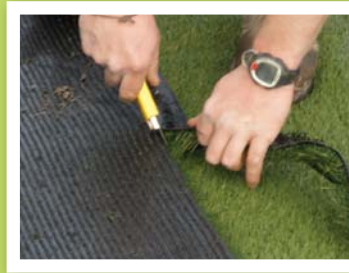
Trimming manufacturing strip

The 300mm seaming tape should be centered at the seam location at an equal distance from each piece of grass. The seaming tape should be held in place at each end with an appropriate weight.