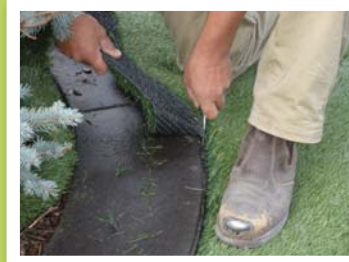
Trimming around edges