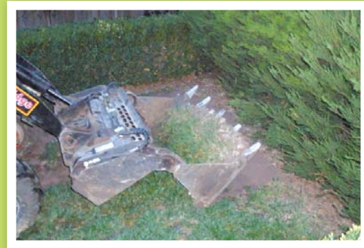
Excavation of area by hand or machine