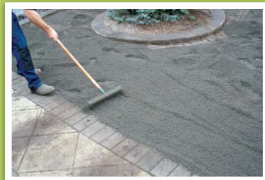
Spreading the 20mm crushed rock