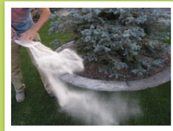
Broadcasting the infill sand