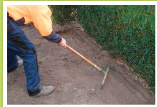
Allow for grass height when installing next to edges