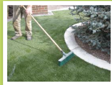
Brushing the grass upright

3. Repeat sand rubber layering and brushing in. Check specifications of the specific product, but most landscape grasses infill to approx 80% of the pile height. Finish by brushing entire surface.