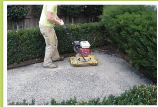
Compacting the base