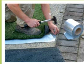
Securing the Ezistrip